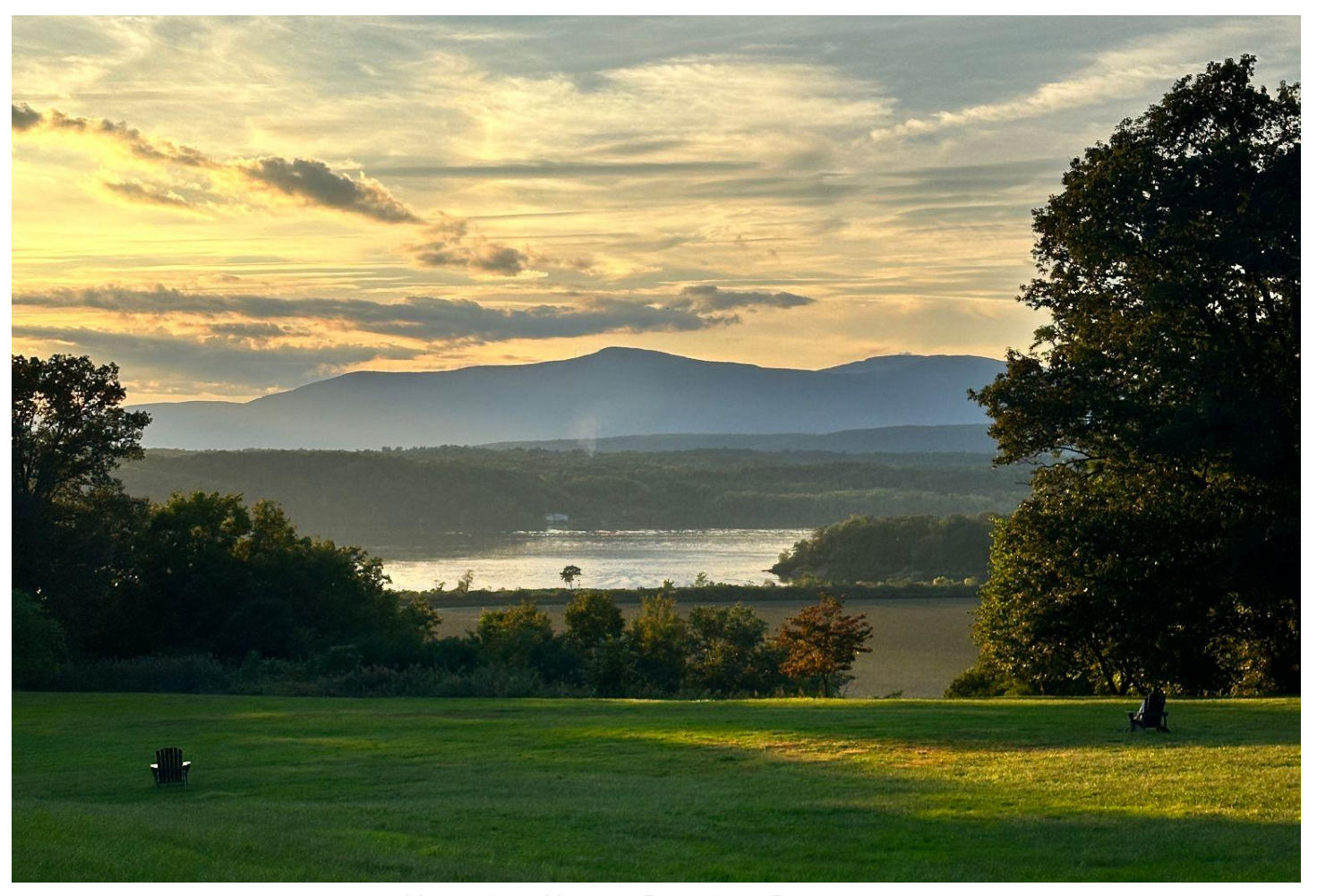
View of the Hudson River from Blithewood

Containing Statistics for 2020, 2021, and 2022