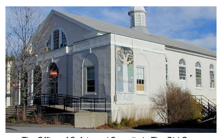
The Office of Safety and Security in The Old Gym

Each residence hall is equipped with a campus telephone located near its main entrance. In addition, Bard has emergency phones located at key points on campus. These hands-free phones offer a direct line to the Office of Safety and Security. One can also report incidents to the Office of Safety and Security in person at the Old Gym, located adjacent to the Olin Humanities Building and South Hall.